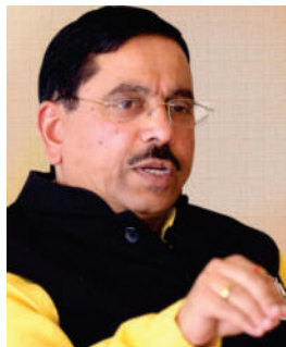
Shri Pralhad Joshi

Shri Pralhad Joshi took over as the Union Minister of Coal & Mines and Parliamentary Affairs on 30 May, 2019. He is a four-time member of the Lok Sabha from Dharwad Parliamentary Constituency in Karnataka. An active Parliamentarian, he is known for his discipline and dynamism.